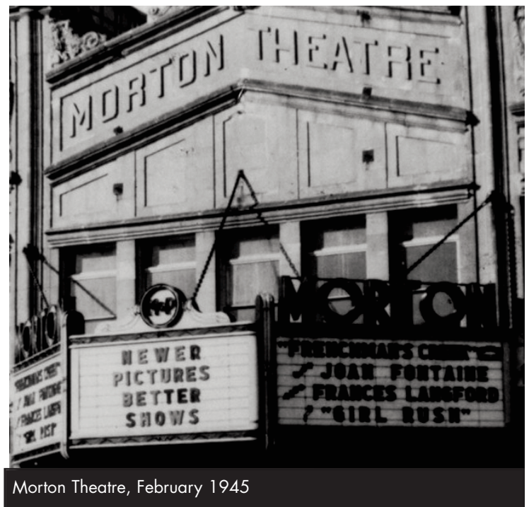
Morton Theatre, February 1945